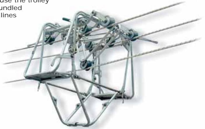
Mod. CRB 020 + CYT 001